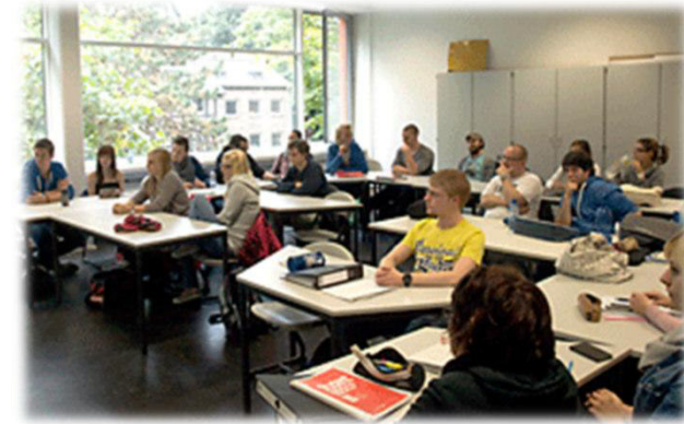
Source: Ministry of Federal Affairs, Europe and the Media of the State of North-Rhine Westphalia